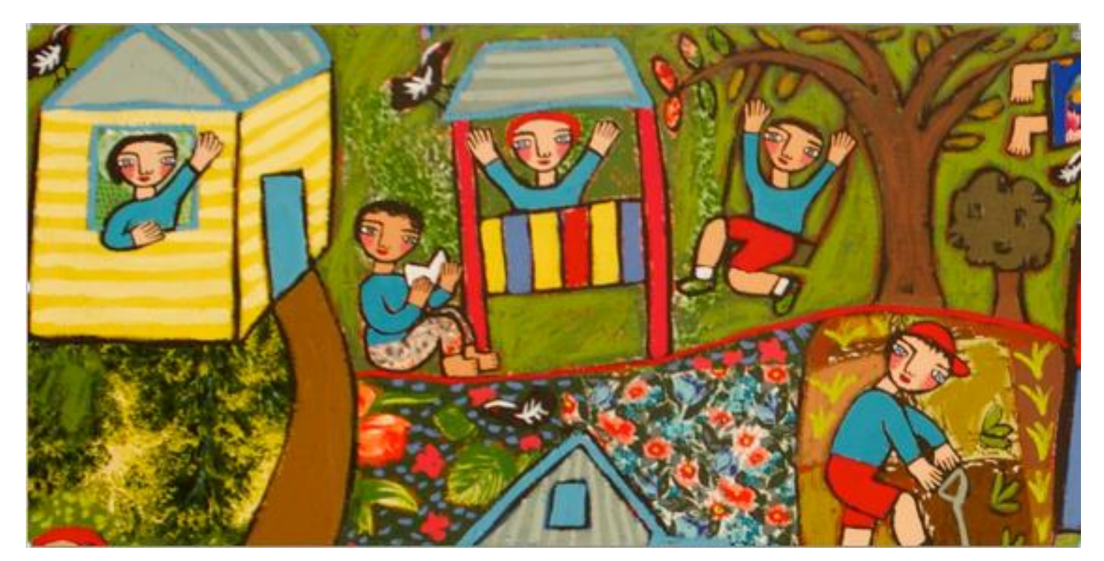
Academic Excellence Creativity Resilience Respect Learning Excellence EST 1982

10890 Bussell Hwy, Forest Grove WA 6286 08 9757 7515 office@mris.wa.edu.au <u>www.mris.wa.edu.au</u>